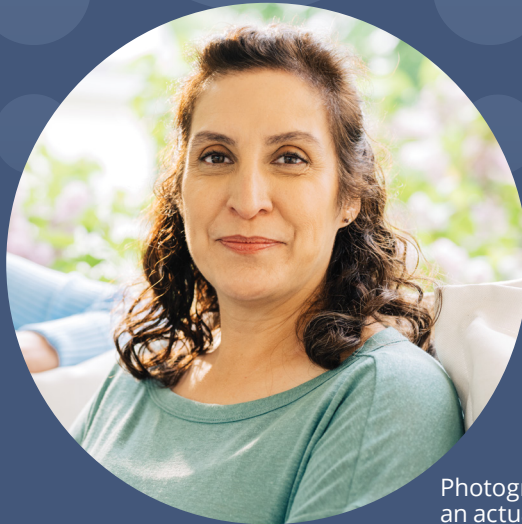
Photograph of an actual patient.